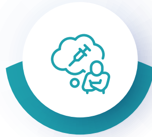
Strong urge to use