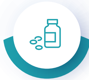
Increasing the amount consumed