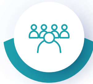
Isolation from social life